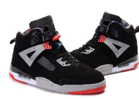
Air Jordan 2010 Silver shoes Jordan 9 AJ9 ID:5113 Free Shipping